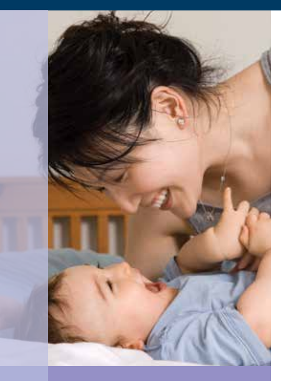
Let LifeTime Benefit Term be your Champion!

Life Insurance with Money for Long Term Care