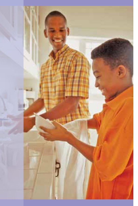
LifeTime Benefit Term is a great way to help protect your most important asset and help provide the peace of mind your family deserves.